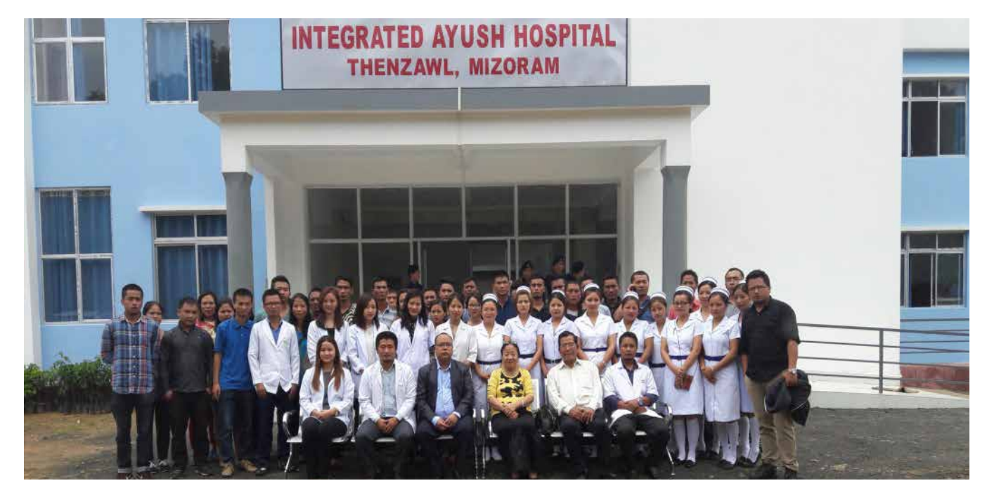
50 bedded Integrated AYUSH Hospital, Thenzawl, Mizoram