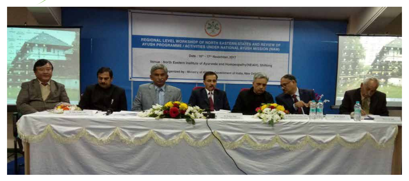
Regional Level Workshop held on 16-17 November, 2017 at NEIAH, Shillong

5.1.6 During the year 2017-18, State Annual Action Plans (SAAPs) from 32 States/UTs have been approved for the component of AYUSH Services, AYUSH Educational Institutions, Quality Control of Ayurveda, Siddha, Unani & Homoeopathy (ASU&H) Drugs and Medicinal Plants by the Mission Directorate and an amount of Rs.355.15 crore has been released up to 31st December 2017.