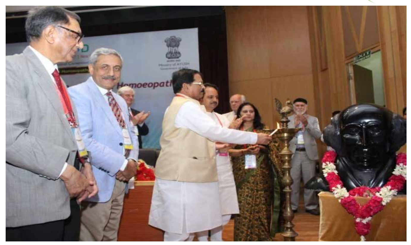
Hon'ble Minister of AYUSH lighting lamp on the occasion of World Homoeopathy Day