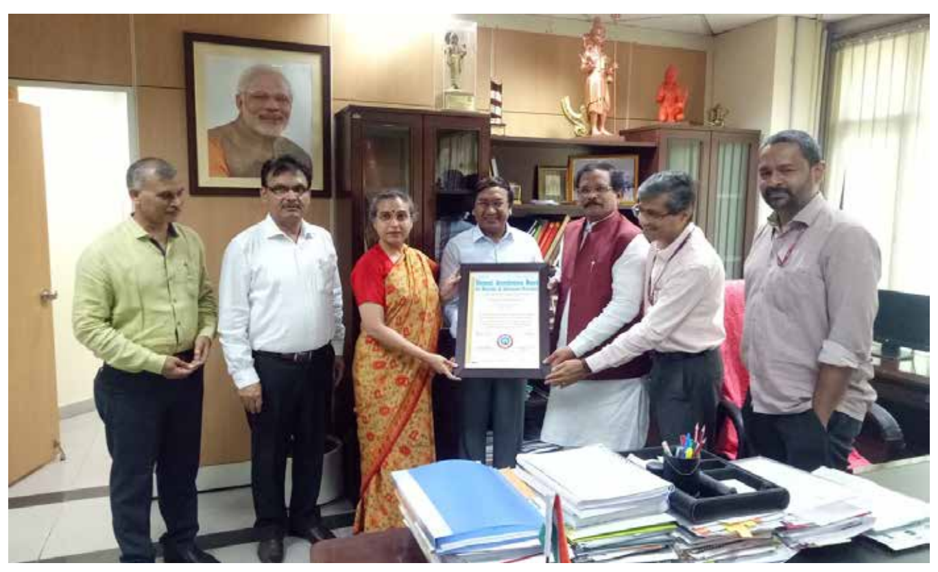
AllA receiving the certificate of NABH Accreditation