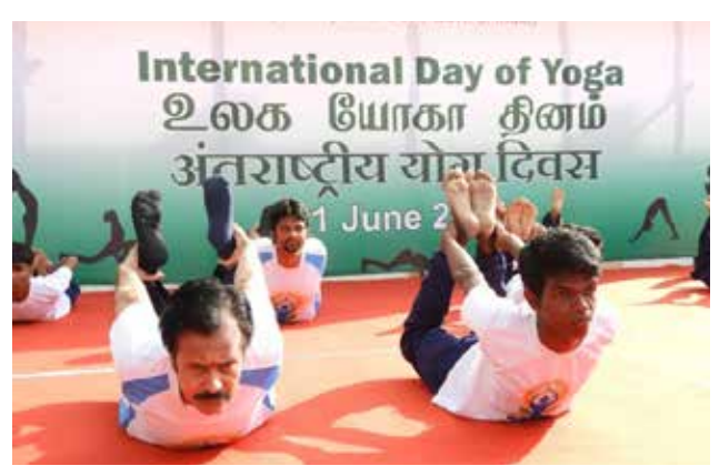
Figure 2: DIRECTOR GENERAL, CCRS PERFORMING YOGA ASANAS ON THE OCCASION OF INTERNATIONAL YOGA DAY