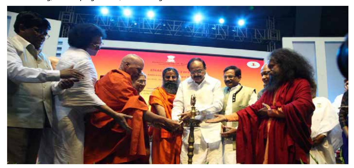
Sh. M. Venkaiah Naidu, Hon'ble Union Minister of Urban Development, Housing and Urban Poverty Alleviation and Information & Broadcasting, Govt. of India lighting the lamp during the 2<sup>nd</sup> International Yoga Fest on 8<sup>th</sup> March, 2017 at Talkatora Stadium, New Delhi

The Fest witnessed the august presence and discourses by eminent Yoga Gurus and many others from Yoga fraternity. The revered Yoga Gurus and Masters shared their valuable views and enriched the audience throughout the fest. Throughout the event, Yoga workshops, Yoga demonstrations, Lectures, Satsang, Cultural programmes, etc. were organized.