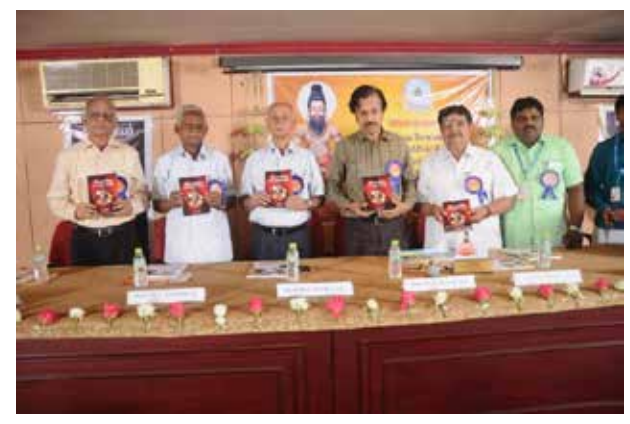
Figure 1: DIRECTOR GENERAL, CCRS AND OTHER DIGNITARIES DURING THE INAUGURATION OF THE NATIONAL SEMINAR ON "GLORY OF SIDDHAR AGATHIYAR AND HIS CONTRIBUTION TO SIDDHA SYSTEM OF MEDICINE" ON 26TH & 27TH AUGUST, 2017