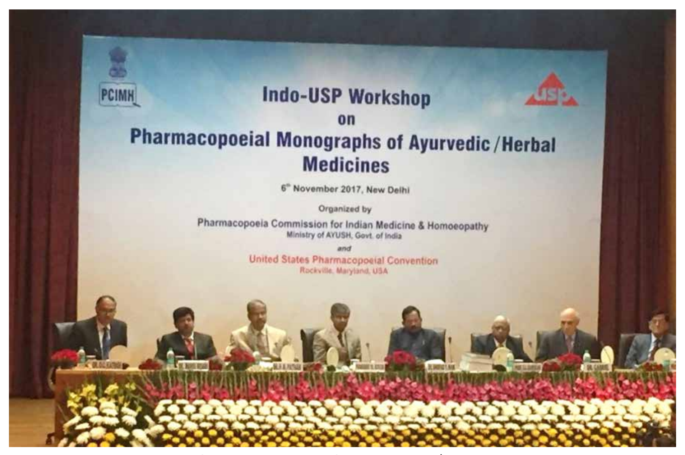
Glimpse of Inaugural Session of Workshop on 6th November 2017

other dignitaries. Eminent Scientists from India as well as USP shared their expertise in the workshop. Members of Pharmacopoeia Committees, Officials of M/o AYUSH, Commission as well as USP, Scientists form Research Councils and Pharmacopoeial Laboratories under M/o AYUSH and Industry Representatives were the benefitted participants.