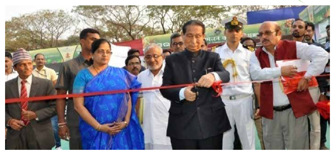
Dr. S.C Jamir, Hon'ble Governor of Odisha inaugurating the National Natural Food Festival at Janata Maidan, Bhubaneswar on 10th Feb 2017