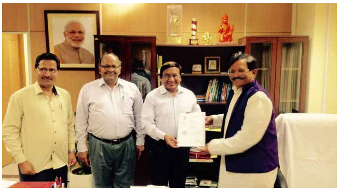
MoU with National Cancer Institute, AIIMS for research in cancer prevention & treatment (24th March, 2017)