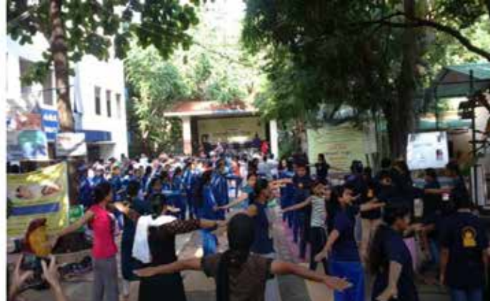
A view of IDY