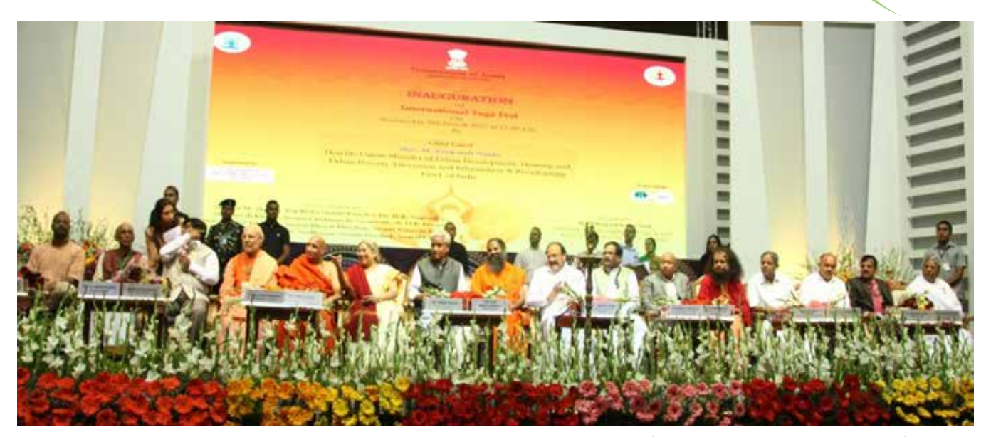
Dignitaries and Eminent Yoga Experts during the inaugural function of 2<sup>nd</sup> International Yoga Fest on 8<sup>th</sup> March, 2017 at Talkatora Stadium, New Delhi

The Fest witnessed the august presence and discourses by eminent Yoga Gurus and many others from Yoga fraternity. The revered Yoga Gurus and Masters shared their valuable views and enriched the audience throughout the fest. Throughout the event, Yoga workshops, Yoga demonstrations, Lectures, Satsang, Cultural programmes, etc. were organized.