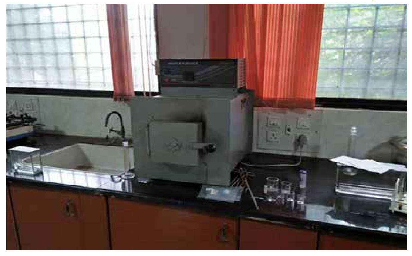
Drug Testing Laboratory, Bangalore, Karnataka