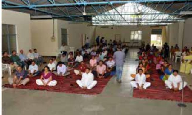
Yoga session is in progress