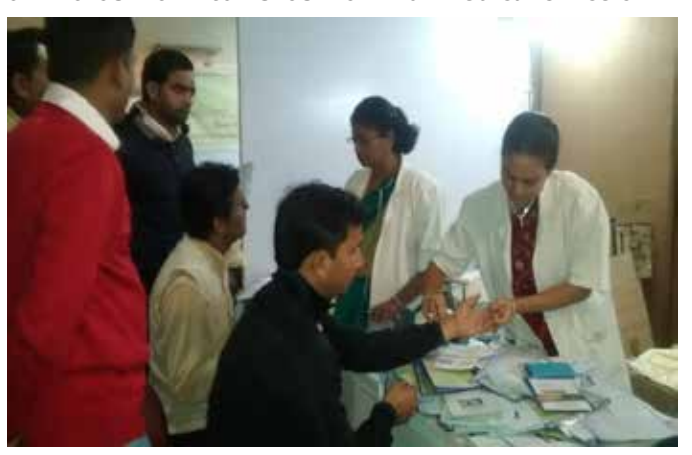
Siddha treatment care to Parliamentary staff