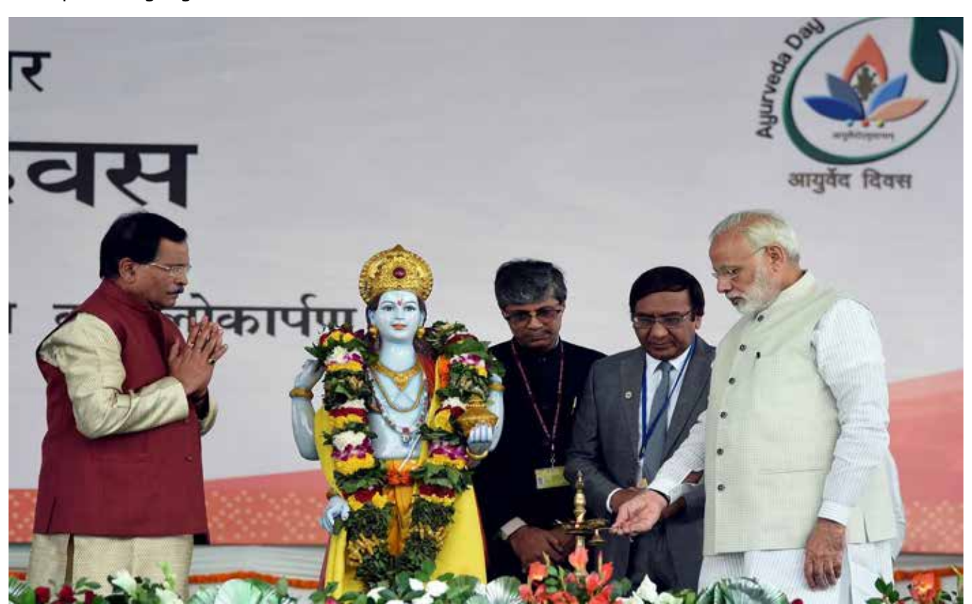
Dedication of AlIA to the country by Honble Prime Minister of India

An MoU has been signed with Morarji Desai National Institute of Yoga (MDNIY) on 18<sup>th</sup> Sept. 2017 for promoting Yoga related activities.