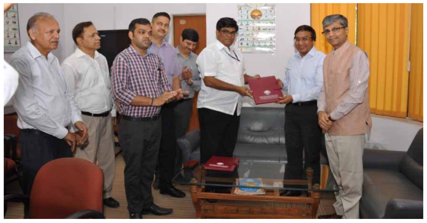
MoU signed between AlIA and Morarji Desai National Institute of Yoga